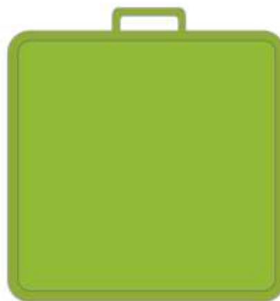
SEAT CUSHION WITH OR WITHOUT SEAT BACK NOT TO EXCEED 18" X 18"