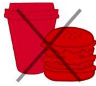
OUTSIDE FOOD/UNSEALED DRINKS